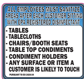
10" x 9" Qty 2 ST1834