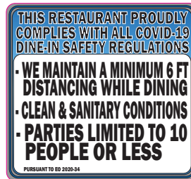
10" x 9" Qty 2 ST1836