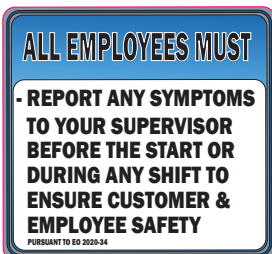
10" x 9" Qty 2 ST1833