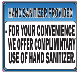
10" x 9" Qty 2 ST1841