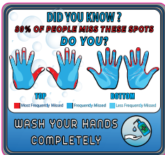
10" x 9" Qty 2 ST1831