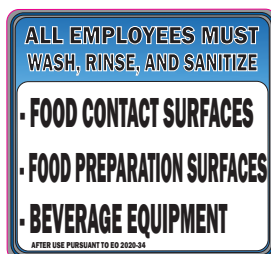
10" x 9" Qty 2 ST1837