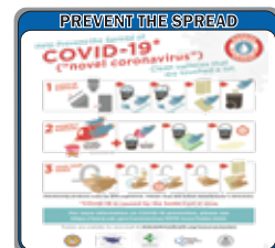
8.5"X11" Qty 1 ST1840