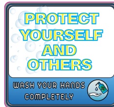
10" x 9" Qty 2 ST1832