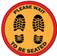
10" x 10" Qty 3 ST1830