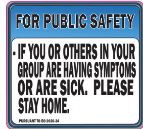
10" x 9" Qty 2 ST1843