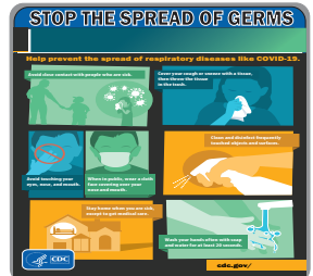
10" x 9" Qty 1 ST1839